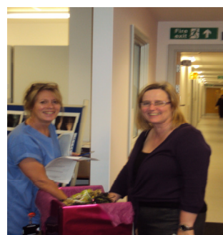
Visitors having a lucky dip!